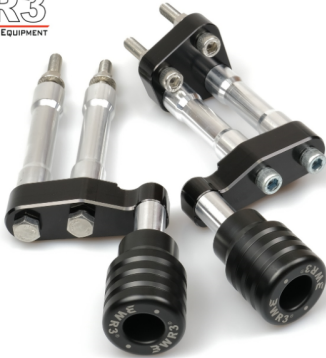
Kawasaki Ninja 300 2016 - 2022