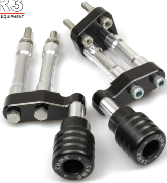
Kawasaki Ninja 300 2016 - 2022