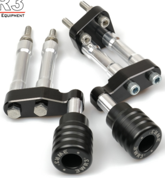
Kawasaki Ninja 300 2016 - 2022